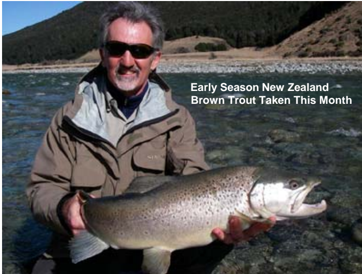
Early Season New Zealand Brown Trout Taken This Month

Yep....you are reading it right. While the dawn of 2008 is still a few months away, we're already working on New Zealand itineraries for 2009. The reason is that NZ has become one of the most desirable travel destinations on the globe.....even without considering the unique stream sight fishing for trophy rainbows and browns. Also, this is the finest couples destination we know of that has "world class" trout fishing. The top lodges and independent guides often book up for the prime time (late January through March) a year or more out – actually, this is also becoming true for their spring and early summer time frame (October, November, and early December). When we plan a New Zealand itinerary, we like to have all the best options available for our clients....and have them available for the time frames we need them. Of course, we can always throw an itinerary together with 4 or 5 months notice, but the most preferable method is to plan far