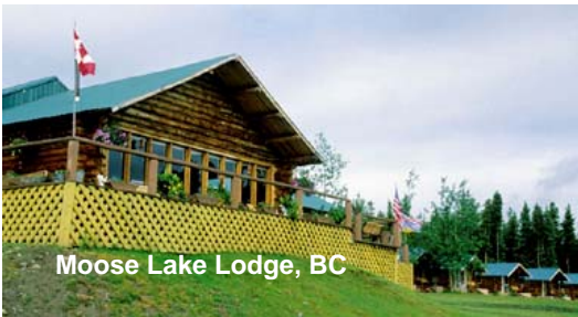
Moose Lake Lodge, BC

We are sometimes asked this question: “if you were going to get on an airplane and take your son, daughter, grandson or granddaughter on a trout-based fly fishing adventure, where would you go?” Of course, an exotic location like Alaska is ideal if you have the time and budget. There are some places remaining in the lower 48.....but my two favorite spots would be on the eastern and western edges of British Columbia. My criteria would be eager, native fish with good numbers available for lots of activity, and, most importantly, fish that were surface oriented. Also, a spot where we could find guides who were excellent at working with kids. One of those two spots would