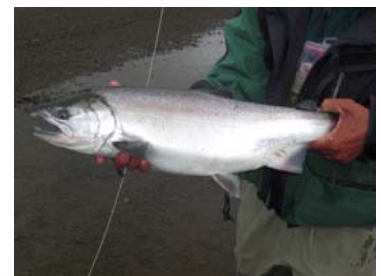
(l to r: Grayling, Sockeye in spawning dress, Chum Salmon, Alaska sized Rainbow)

Josh Luft-Glidden (above) visited the Goodnews in August and does a nice job of describing why taking Silvers (at left above and right) on the surface is one of fly fishing's great thrills: “The Silver follows the fly, swimming just below the surface until it finally strikes. It's like a scene from a movie! A wake appears behind your fly, slowly closing on it until the fish takes it in a flash of jaws and teeth. The first time I saw it I was dumbfounded, and just watched the take without setting the hook! After I hooked one, it was off to the races. The fish were fresh from the sea, and it showed. They took off on long screaming runs and acrobatic jumps - like catching a wild steelhead on a dry fly.”