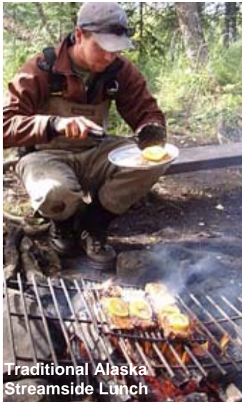
Traditional Alaska Streamside Lunch