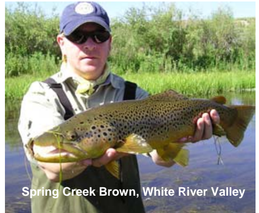
Spring Creek Brown, White River Valley

A group of local guides who used to guide at the famous (and now defunct) Elk Creek Lodge banded together and secured some leases from large ranchers in the White River Valley. Wonderful walk'n'wade fishery on the main river and, due to exploratory efforts last year, two spring creeks and a beaver pond with large browns. Also, float fishing is available on other rivers. Unique and tastefully restored 100 year old five bedroom ranch house on the property is your headquarters. The entire ranch house can be rented exclusively for a family or group for $600 per night making this an exclusive type experience. Do your own cooking or a chef is available. Generally, the weather usually allows this to be a good early season fishery from mid March to mid April. Good four night trip with three days fishing.