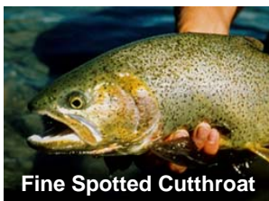
Fine Spotted Cutthroat

SOUTH FORK OF THE SNAKE RIVER CANYON OVERNIGHT FLOAT TRIP..... is the centerpiece of this adventure in eastern Idaho. The overnight is spent in a comfortable, stationary tent camp in the canyon. Restricted number of boats allowed per day. Add one or two days of guided fishing in the area on the front or back end for a complete three or four day experience.