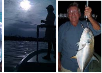
Casting At Dark